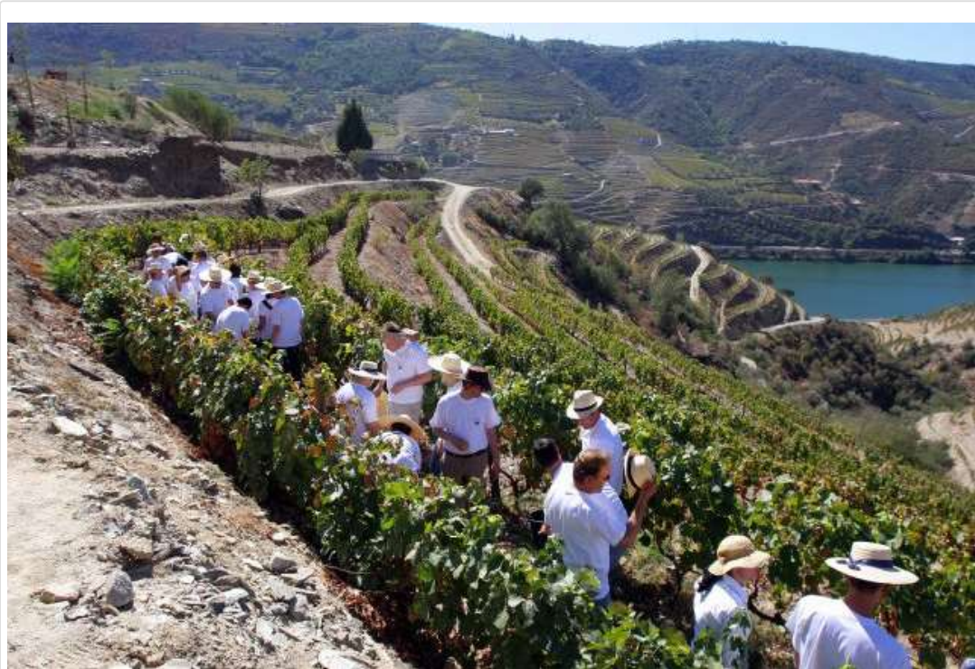
Harvest time at Quinta Nova in the Douro Valley

Portuguese wine sales are soaring in the UK, with Portuguese specialist Oakley Wine Agencies reporting year-on-year volume and value growth of over 60%.